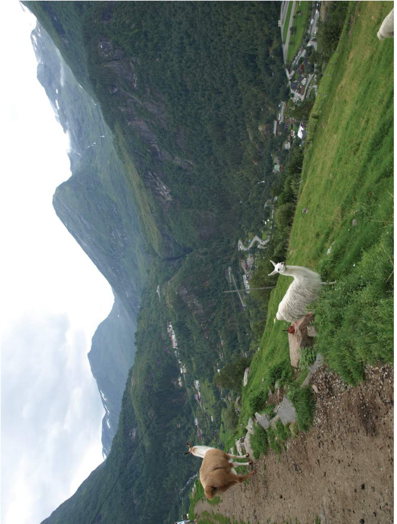
Photograph A for Question 1